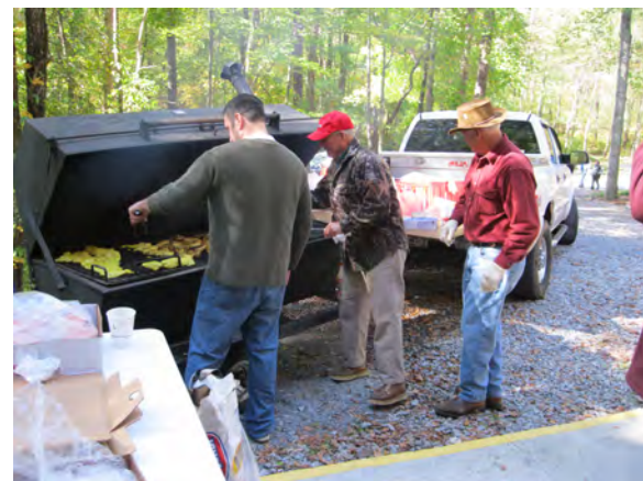
The North Cobb Rotary grill team at work