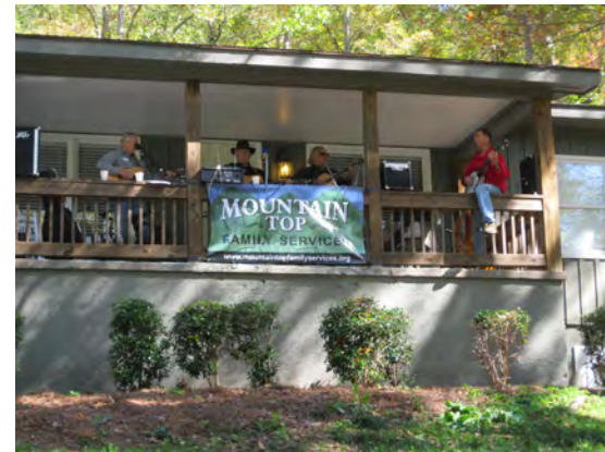
The Porch Pickers provided great music

For the 23rd year in a row the North Cobb Rotary Club provided outstanding grilled meats for the annual BBQ held at Mountain Top. Mountain Top has been one of their top outreach missions for many years and the BBQ they host is a great opportunity for those who care about its future get the chance to meet other like-minded people. As in years past the ladies of Calhoun First UMC and Lafayette First UMC along with the men of Dalton First UMC provided outstanding side dishes, desserts and condiments to compliment the Rotary's grilled meats. Tours of the boy's home were topped off with delicious home made ice cream that was churned by the boys for their guests. Many visitors took the opportunity to walk up to the nearly completed outdoor chapel to sound out its acoustics and to see the benefits of newly planted shrubs and trees. This year the BBQ featured live music via the Porch Pickers who played from the front porch of Oak Leaf Lodge for all to enjoy.