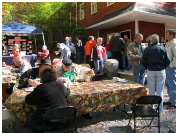
A record crowd this year