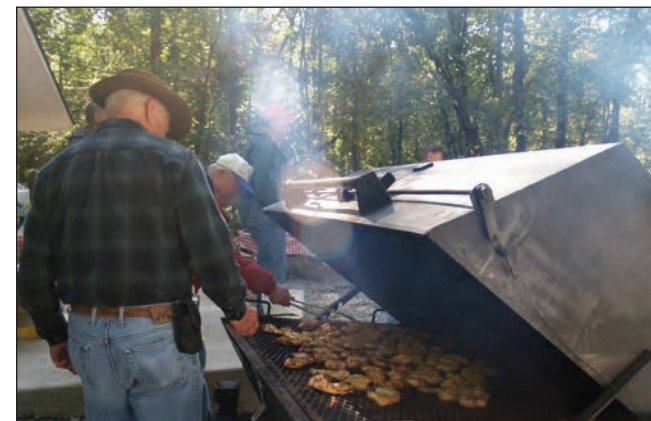
North Cobb Rotary has led the Mountain Top BBQ for 19 years. We are forever thankful to them.