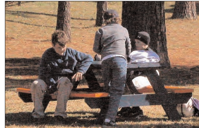
After all – it is all about the boys.